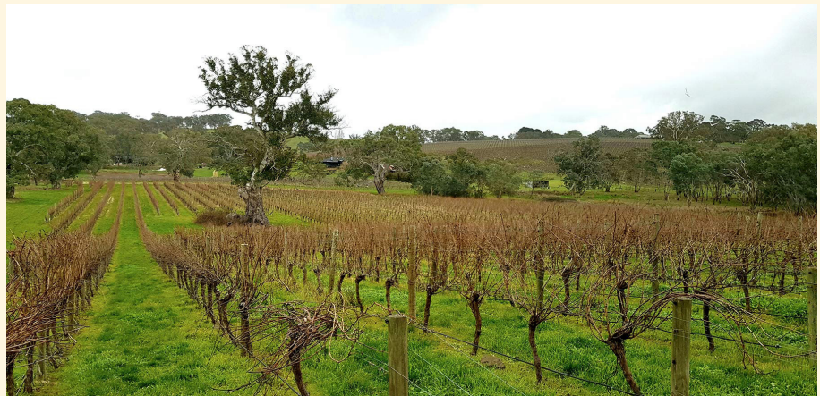
Pinot Blanc site out the back of Woodside

This year's release sees two wines and, as per last year, both come from high-altitude, late-ripening sites in the Adelaide Hills. In 2017, Adam and Nicole had a singular goal of capturing the essence of the growing season and the sites: “The Adelaide Hills had a very cool season, with sites regularly harvesting 4-6 weeks later than 2016. Spring started out cool and wet; it was a vintage that never really ‘caught up’ temperature wise with recent seasons and (day degrees wise) was more in line with 2004 and 2011. The one major difference with 2011 was rainfall. As we approached January, things began to dry out and although it was cool, it was dry, meaning intense fruit with great natural acidity. An outstanding vintage.”